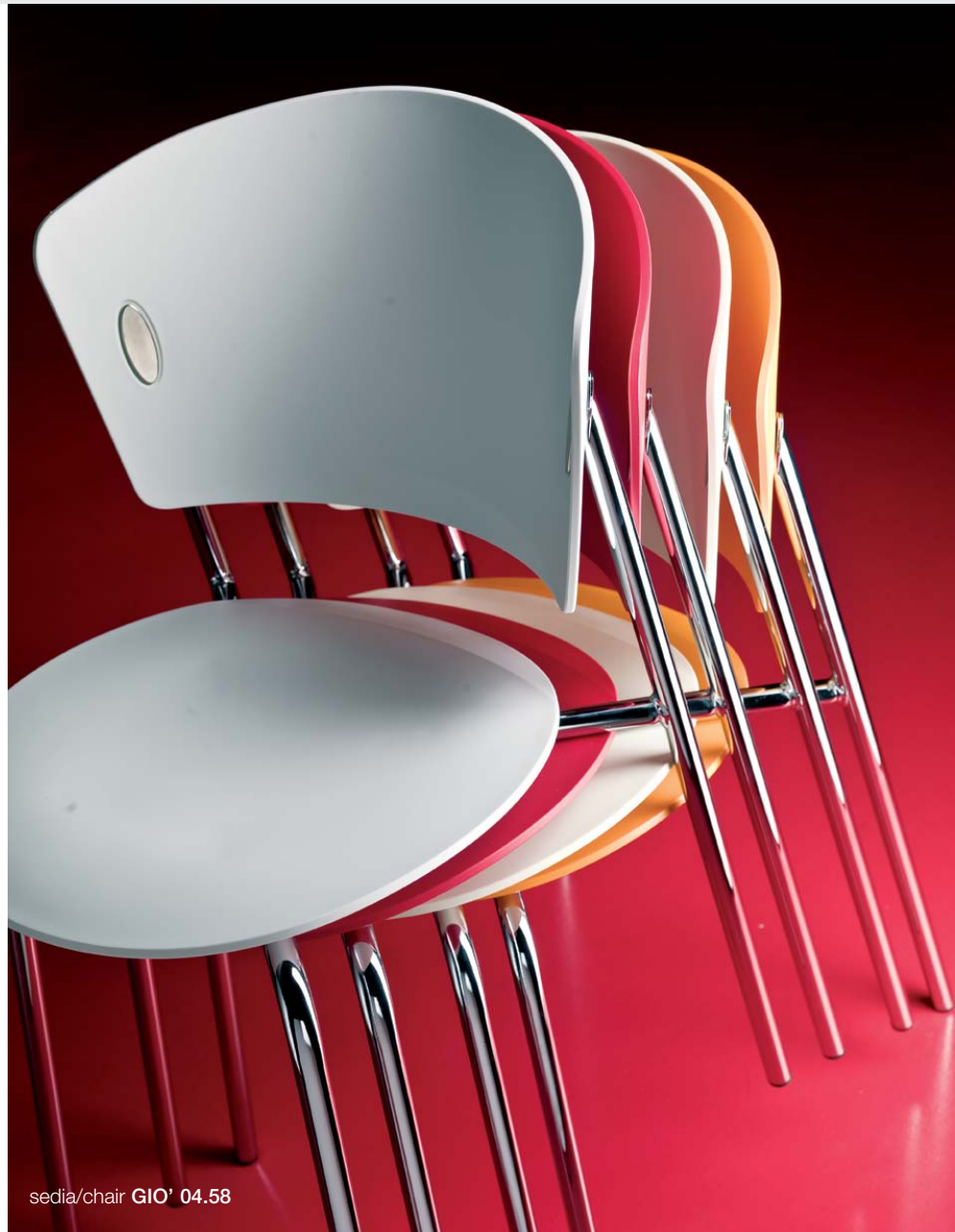
sedia/chair GIO' 04.58